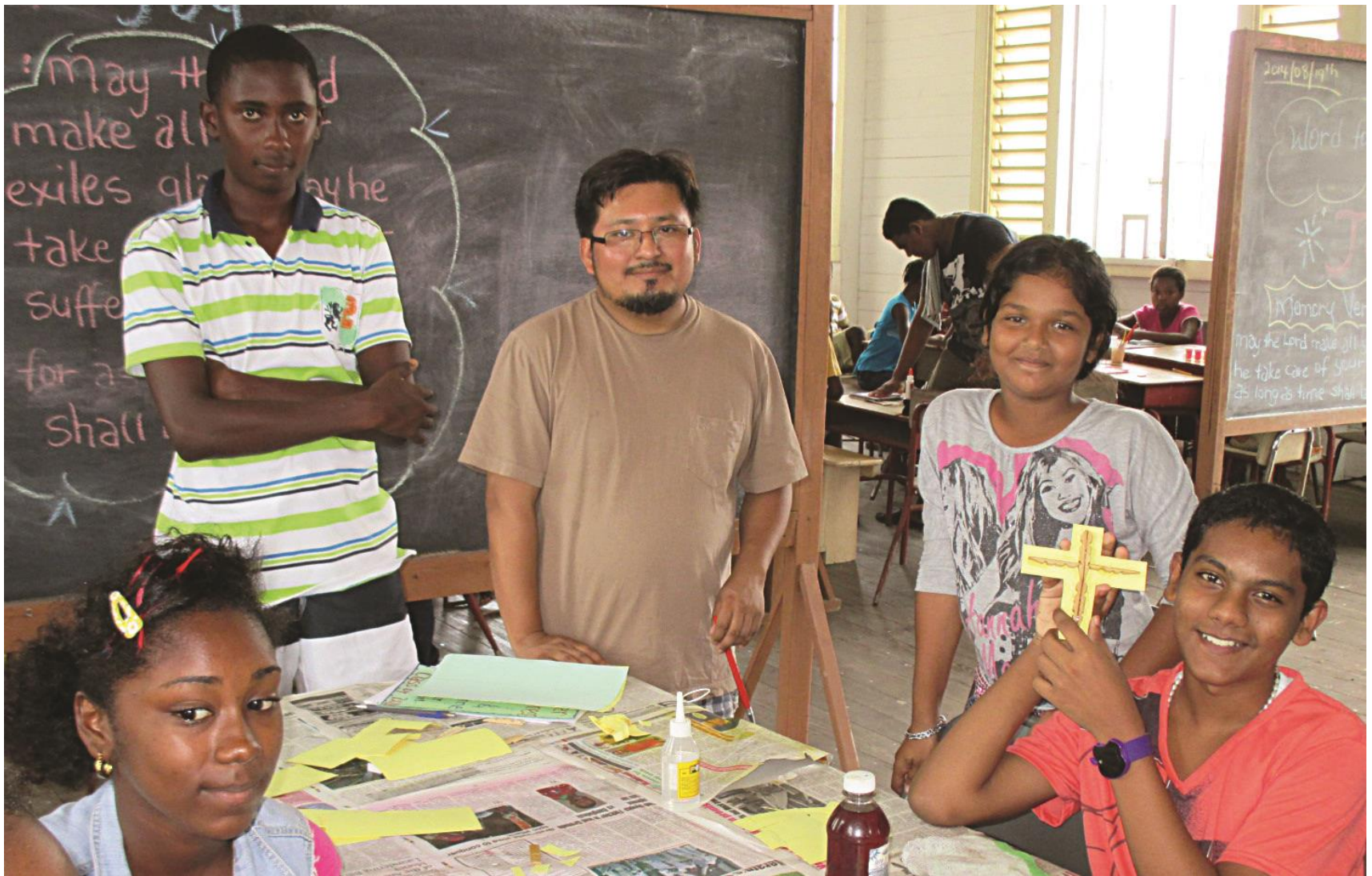
He now serves in Honduras ministering to refugees and migrants.