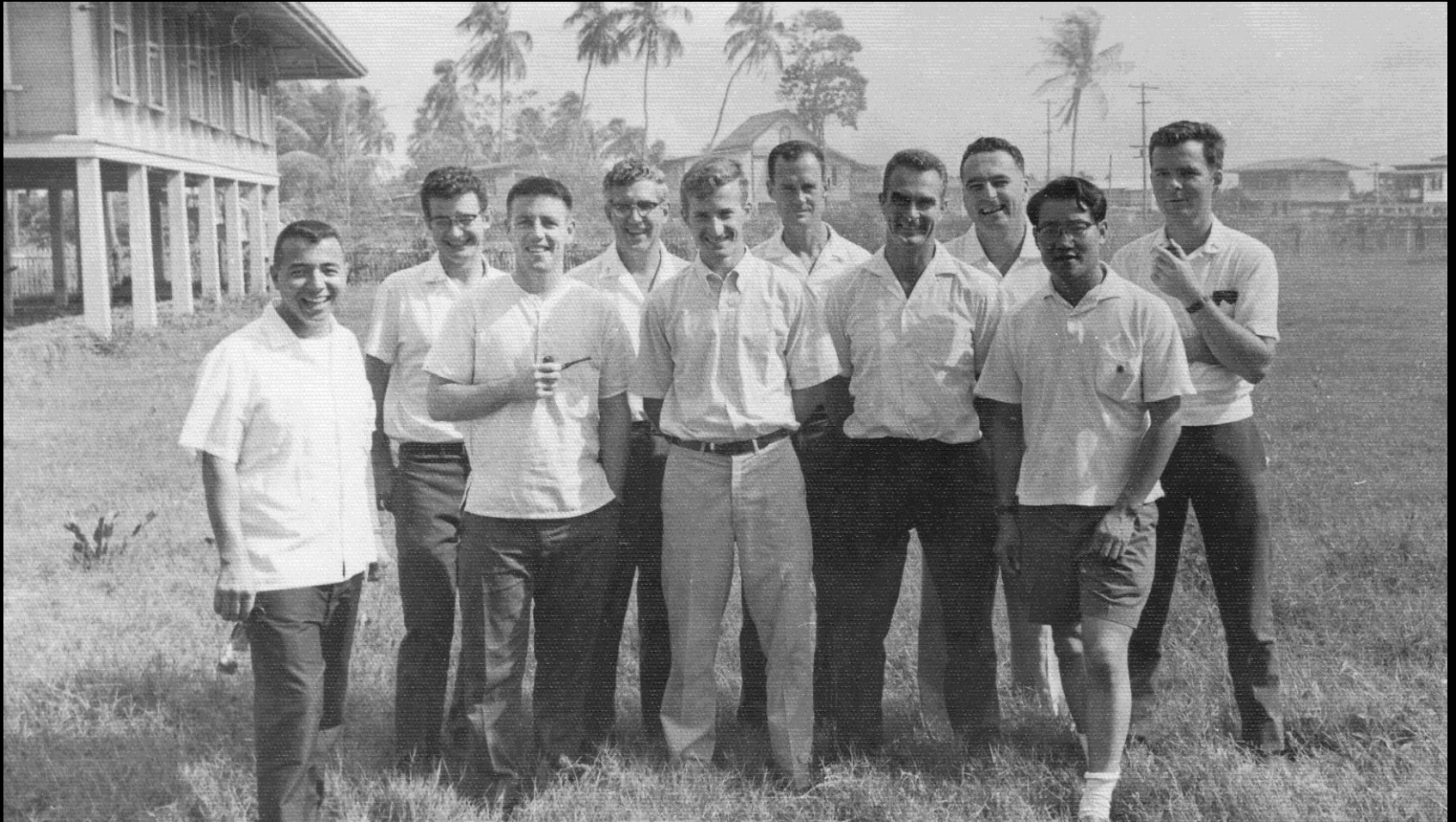
At the Central House in Providence. Circa 1970.