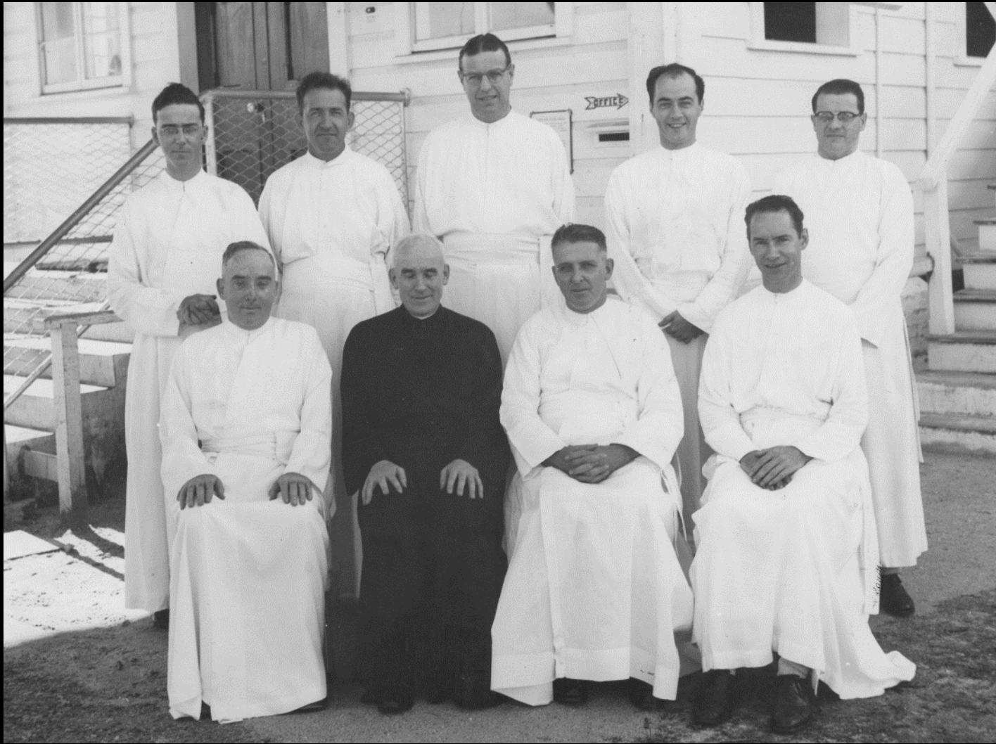
Scarboro priests serving in British Guiana (Guyana). February 9, 1956.