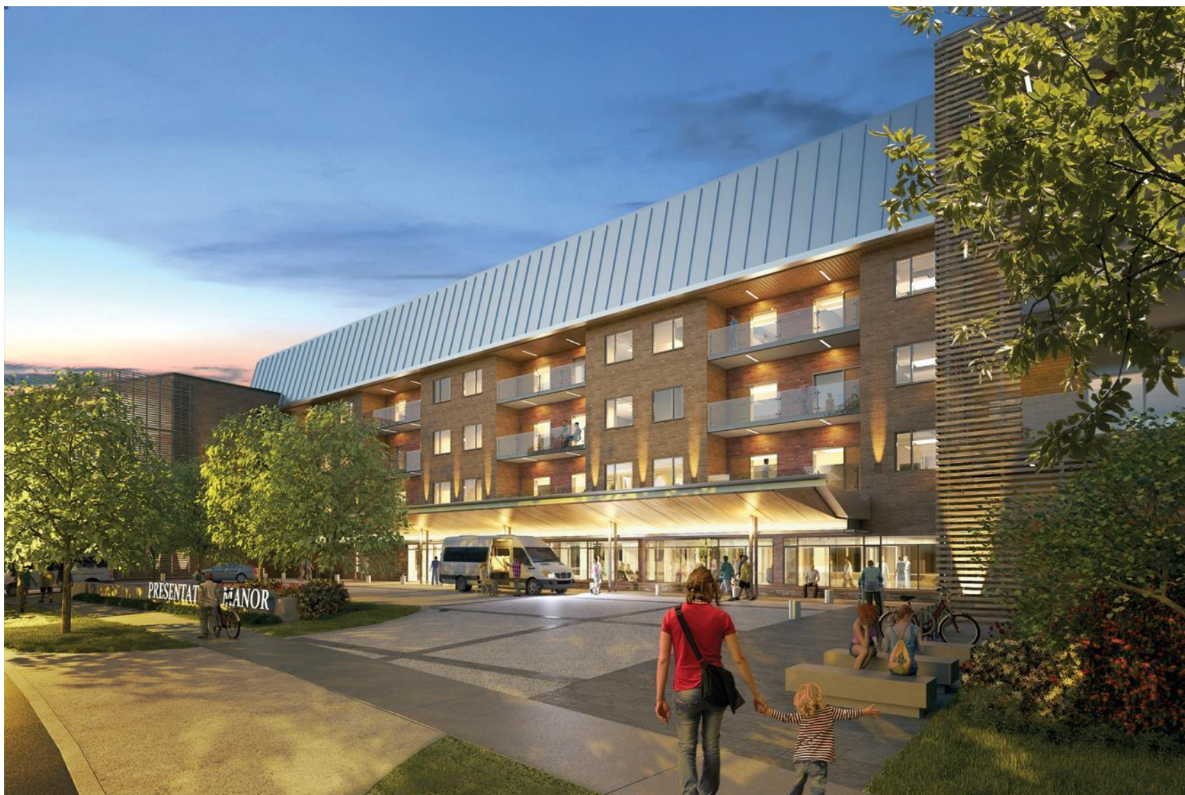
In the fall of 2018, Scarboro Missions, along with other religious communities in Toronto, will relocate to Presentation Manor, a newly built seniors' residence in Scarborough.