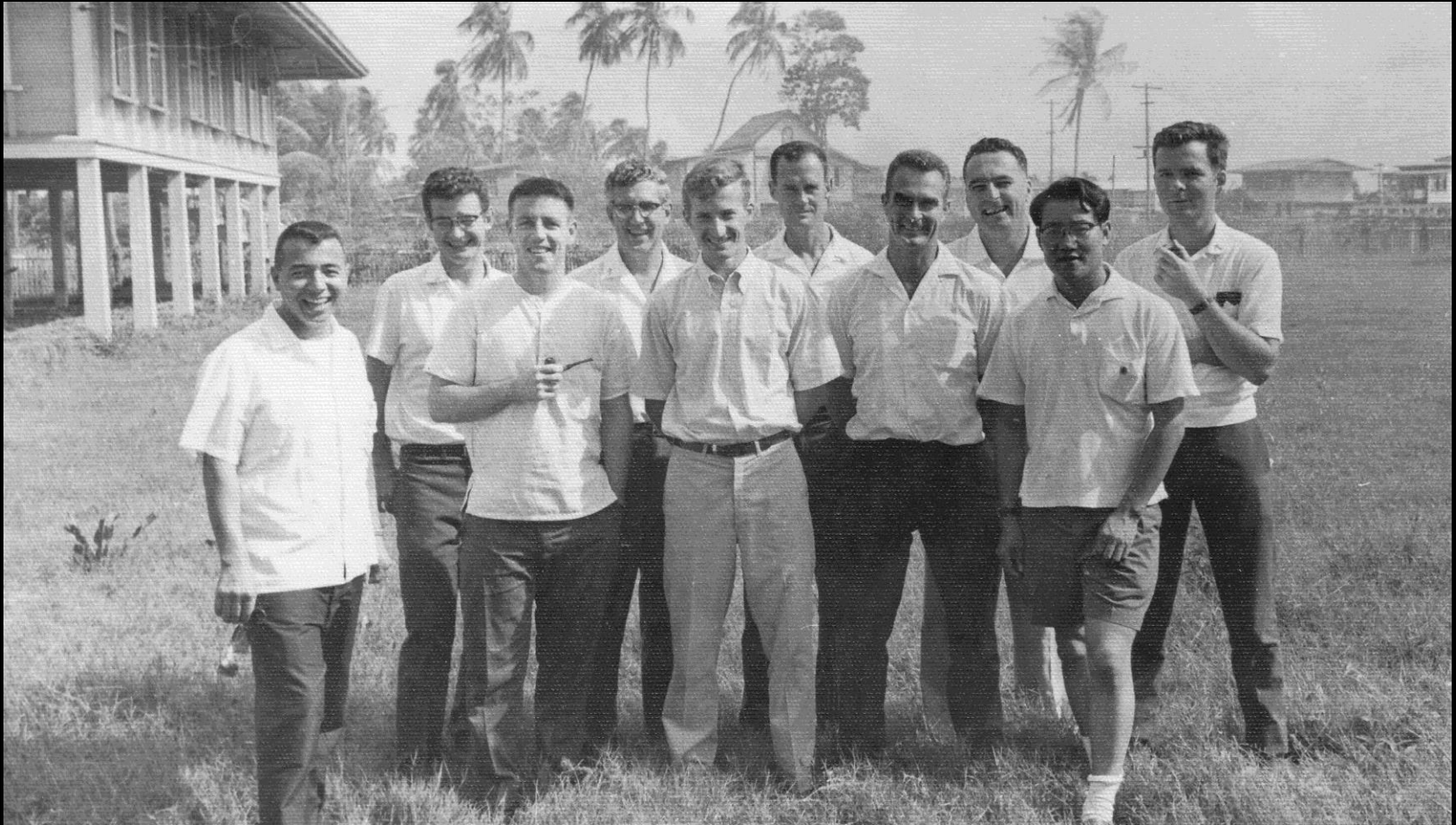
At the Central House in Providence. Circa 1970.