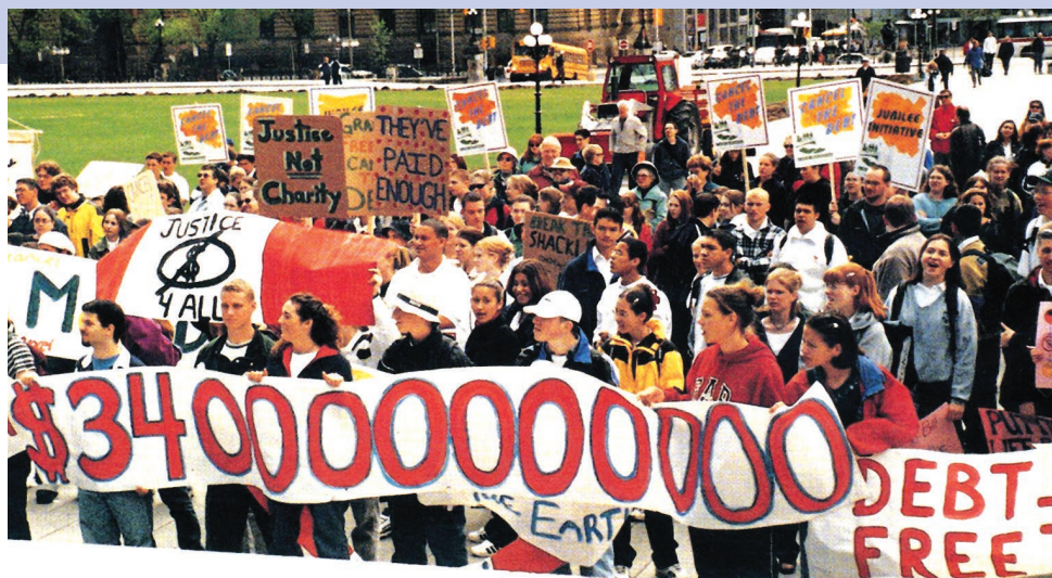
Catholic high school students on Parliament Hill, Ottawa, take part in the Jubilee debt campaign, which sought to eliminate CDN$340 billion of debt owed by the world's poorest nations. May 11, 1999.

In addition to ecumenical justice work I was interested in exploring interfaith possibilities. Scarboro Missions' interfaith office connected me with the Toronto Chapter of the World Conference on Religion and Peace (WCRP), a coalition promoting cooperation among the world's religions for peace. I joined WCRP and then I also became involved in the initial years of Faith & the Common Good, which was established to support Canada's diverse faith communities to seek common ground for the common good. By 2003 I was working alone in the