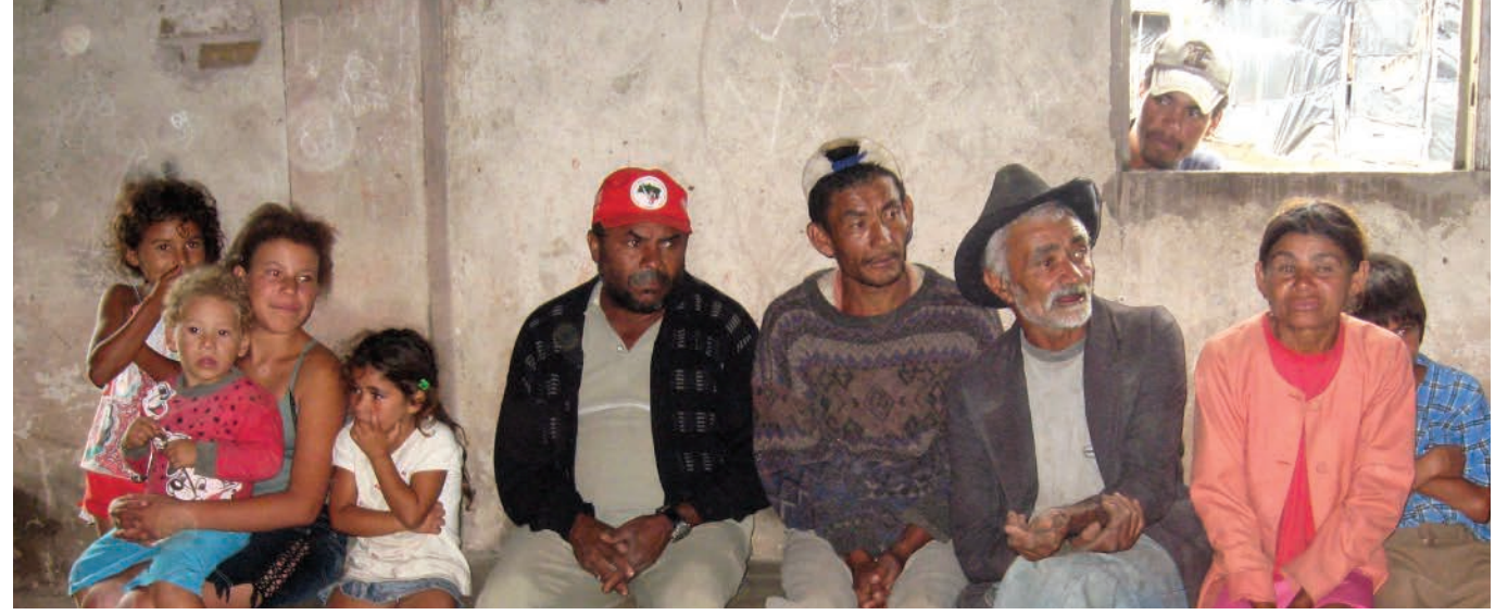
Pausing from their day's work, the people gather in their community centre to welcome us and share stories of their struggle for land.