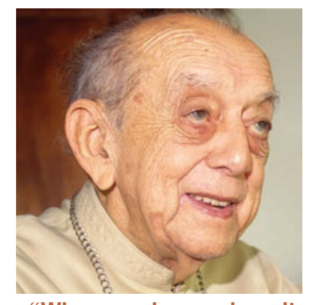
"When we dream alone it is only a dream. When we dream with others, it is the beginning of reality."

Dom Helder Câmara (1909-1999), Archbishop of Recife and Olinda, recalling a Brazilian proverb