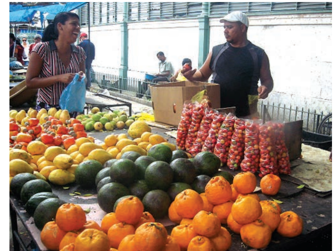
Left: The view from Olinda ("Oh Beautiful"), looking across the bay to the city of Recife, capital of Pernambuco State. Above: Market scene.