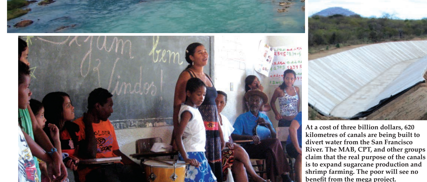
Young people of the community packed the school room where we met and listened attentively as their teacher and others spoke to us about the proposed hydro dam.

is a large wealth disparity between the rich of Brazil—where 1.6% of the population control 47% of the land—and the poor who have very little material power. In this country there is a disconnect between the desires of the rich and the needs of the poor. Past experience in Brazil has shown that when hydroelectric dams are built, the people are forcibly evicted and not properly compensated for their lands. Ironically the dams provide little benefit for the people affected. This fact is clear to the Quilombo people who are against this mega project and ask the question, "Development for whom and for what?"