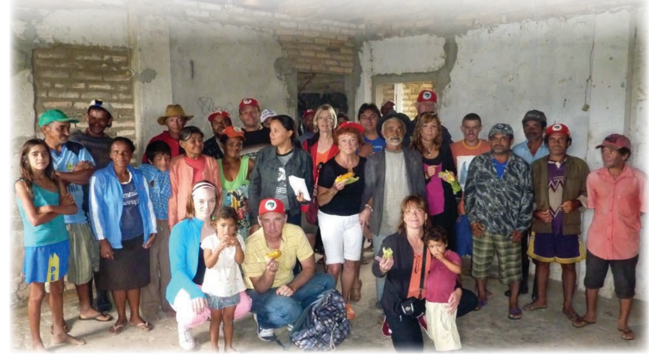
After our meeting with the community of Fazenda Jabuticaba, we were offered a simple meal of roasted corn on the cob. One hundred families live beneath the black canvas tents, but that day most were away at market.