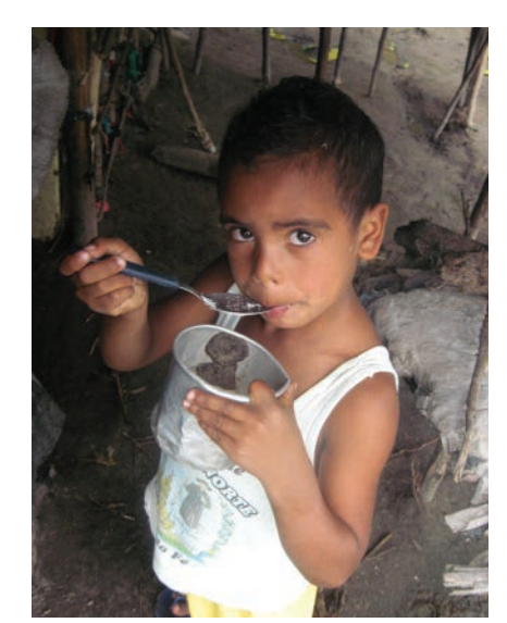
Eating a snack of dry manioc flour.

defined as the day I was brought, along with my companions, deep into the wilderness, in the closed back of a dirty old truck, along a maze of muddy trails, to find a community of landless peasants. We were welcomed into their homes, nothing more than stick tents covered in black garbage bag plastic. We were introduced to their most precious treasures—their children; barefooted little creatures eating dry manioc flour out of dented tin cups; children who were born into these conditions and who have never known any life apart from this. We were welcomed wholeheartedly. The peasants shared their stories of survival. They gifted us.