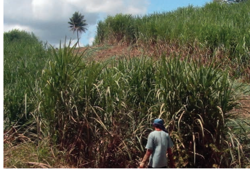
Photos above and right: After eviction by the sugar plantation owners, the people were intimated and abused in their struggle for land, but they were victorious. Without land, they would have been forced to the cities where there is no work, and to live in dangerous slums. Today, the three communities live in one area, sharing the land in common, with each family in their own home and able to support themselves.

destroyed, the river water poisoned, and sand put in the wells. The people no longer had access to the river to wash their clothes.