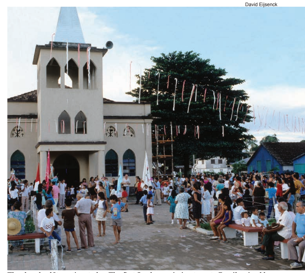
The church of Itacoatiara today. The first Scarboro mission team to Brazil arrived here in 1961 to walk with the people.

Bishop McHugh, ordained as bishop of the prelacy in 1965, attended the final sessions of the Second Vatican Council. The Council's emphasis on the church as the "People of God," and the Latin American bishops' "preferential option for the poor" at Medellin in