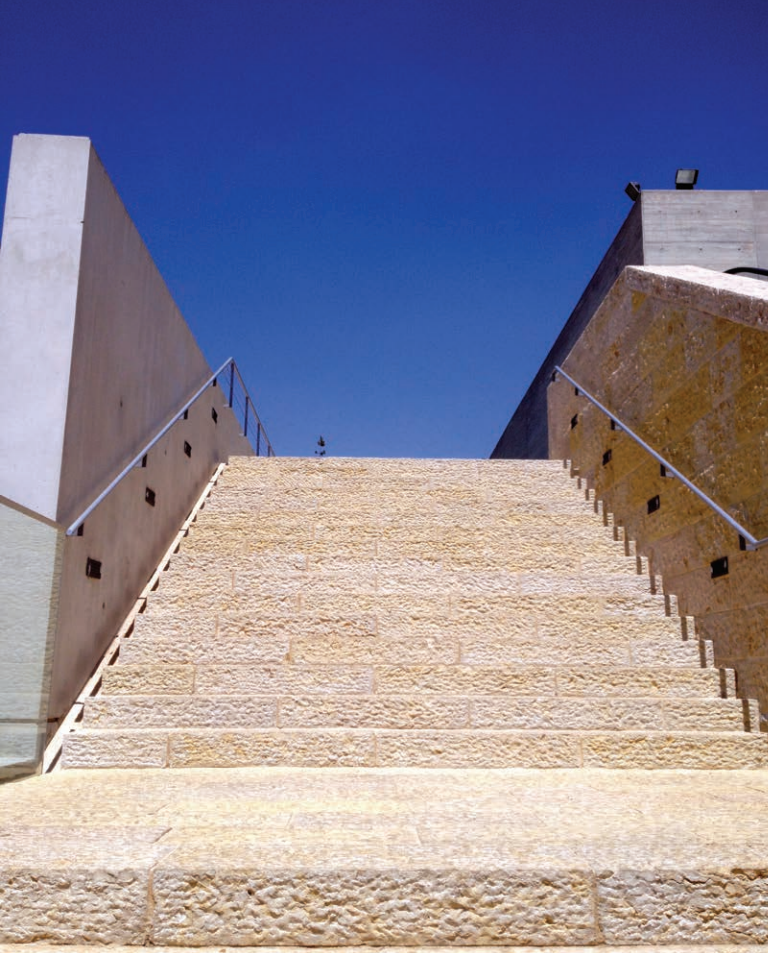
Yad Vashem Holocaust Memorial Museum in Jerusalem.