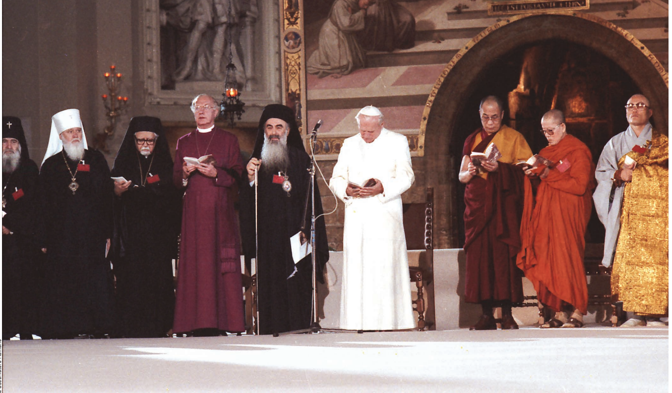
In 1986, Pope John Paul II invited leaders of the world's religions to Assisi, Italy, to pray and fast for world peace. In so doing, he became the first prominent religious leader in history to convene such a gathering.

of them because of their race, color, condition of life, or religion" is "foreign to the mind of Christ."