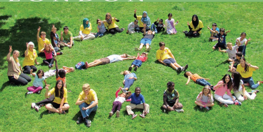
Christian, Jewish, and Muslim children come together at King's University College (University of Western Ontario) in London for the third annual five-day interfaith peace camp. August 2015.